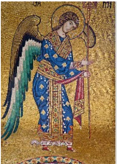
Mosaic of Archangel Michael from Church of Santa Maria dell' Ammiraglio from 12. cent. in Palermo, Italy.

St. Michael the Archangel, defend us in battle.